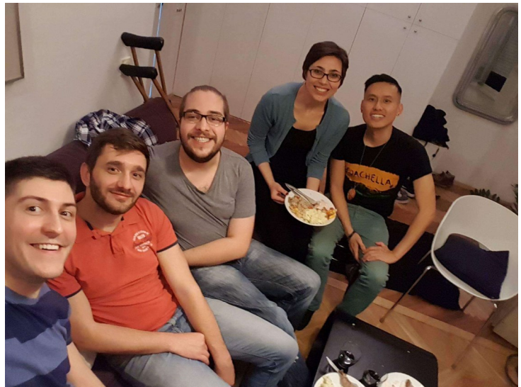
Above: Spending Thanksgiving with newfound friends (Belgrade, Serbia)