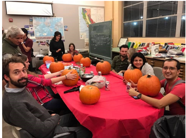
GLOBAL Pumpkin Carving Night, 2017.